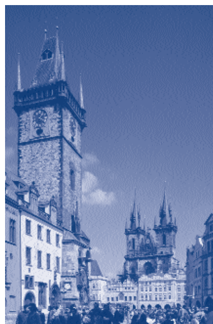
Old Town Square

This church, built between 1704 and 1755, is the most significant historical structure of Prague Baroque. The architects were G. Santini, K. I. Dienzenhofer, and A. Lurago.