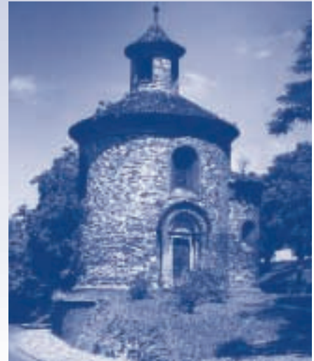
Vysehrad–St. Martins's Chapel

ABOATECH AGILENT TECHNOLOGIES AUDIT DIAGNOSTICS AXIS-SHIELD BAYER BECKMAN COULTER B.M.-COMP BIOCHEM IMMUNOSYSTEMS BIOFONS BIOMERIEUX BIO-RAD LABORATORIES BIOSYSTEMS CLB CLONIT