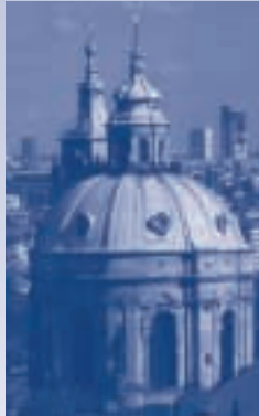
St. Nicholas Church

An important part of the area is also Vysehrad – an old stronghold according to the legend the site of Libussa's castle, the cradle of Bobemian history. The first documentary reference however is from the 11th century. The outer walls of the fortress have survived together with Romanesque St. Martin's Chapel and the Church of St. Peter and Paul later reconstructed in Gothic and neo-Gothic styles. Next to the church surrounded by arcades is the Vysehrad cemetery with the „ Slavin “ (Pantheon) where many famous Czechs are buried.